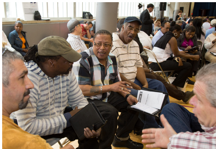
Employees meet in focus groups to discuss safety concerns.

"Everyone deserves to feel safe at home and at work," GM Kelly said. "Keeping each other safe goes hand in hand with our service to residents—