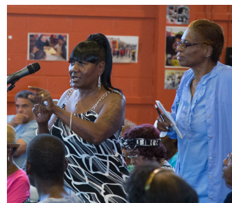
Residents asked questions at the meeting.

NYCHA already manages the nation's largest Section 8 program, which provides approximately 220,000 people with federal Section 8 vouchers.